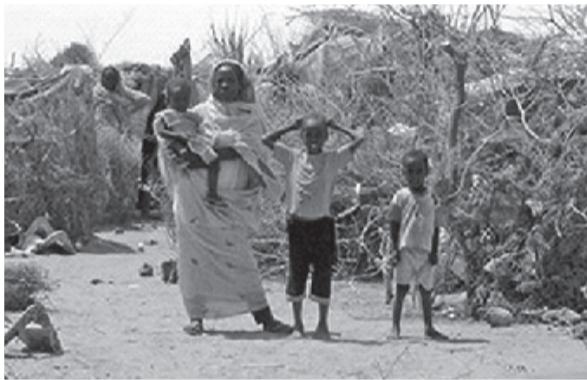
A family in a refugee camp in Darfur

This one year project was completed in April 2008 and was funded by Oxfam. For more information contact Davina.