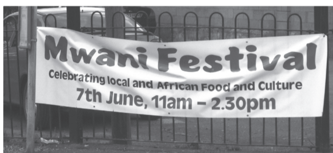
Festival Banner, Maesbury

"The event had a really good community feel...parents were really chuffed with the children's African dance performance". Head teacher, Maesbury School