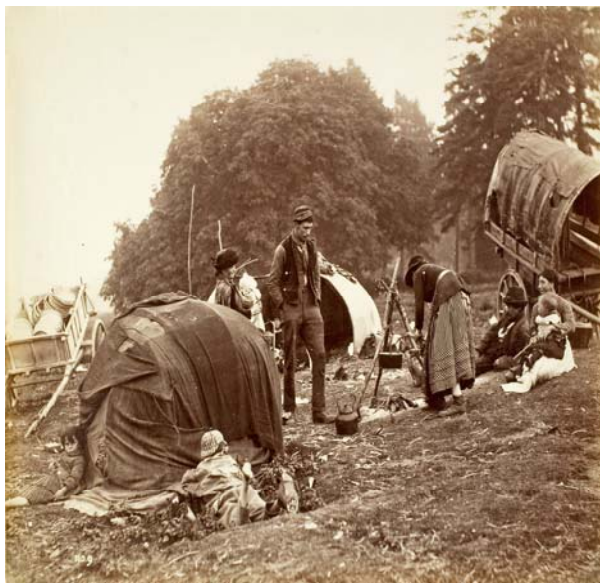
A Gypsy site c.1890